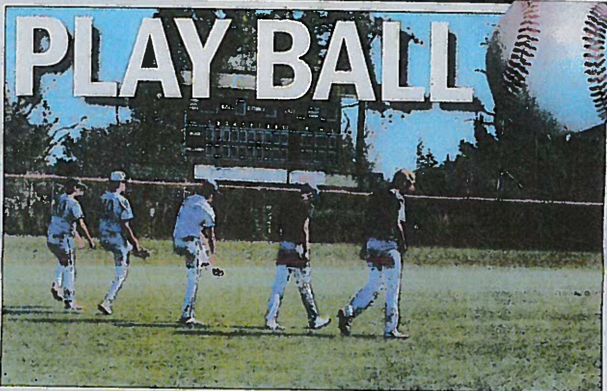
Placer High School baseball players stretch on the renovated James Field on Monday.